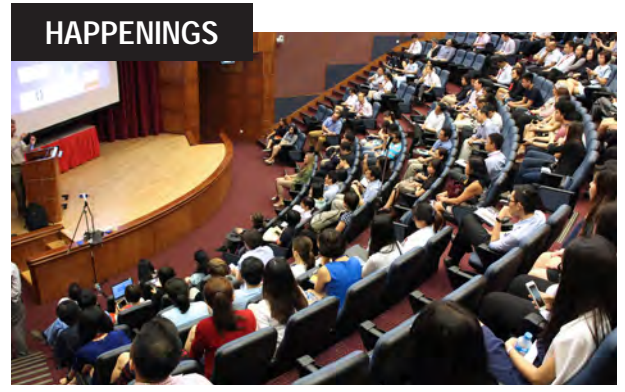
Streaming 'Live' for the First Time