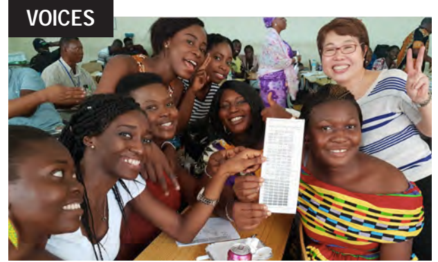
Gap Year in Sierra Leone